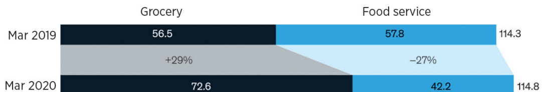
US consumer food spending, Mar 2019 vs Mar 2020, $ billion

Source: Administrative records; McKinsey Annual Retail Trade Survey; McKinsey Monthly Retail Trade Survey; McKinsey Service Annual Survey